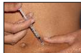
With Gonal-f Multi-Dose 1050 IU