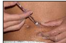
With Gonal-f RFF 75 IU